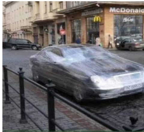
Clearly there must be more to this story.

Which classic Mercedes-Benz would you take for a nice Sunday drive