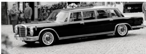
Never enough pics of a 600 Pullman