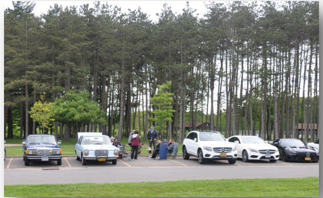
May 25 Starz & Coffee at Elma Town Park

Next meeting will be held July 6 at Glen Park in Williamsville.