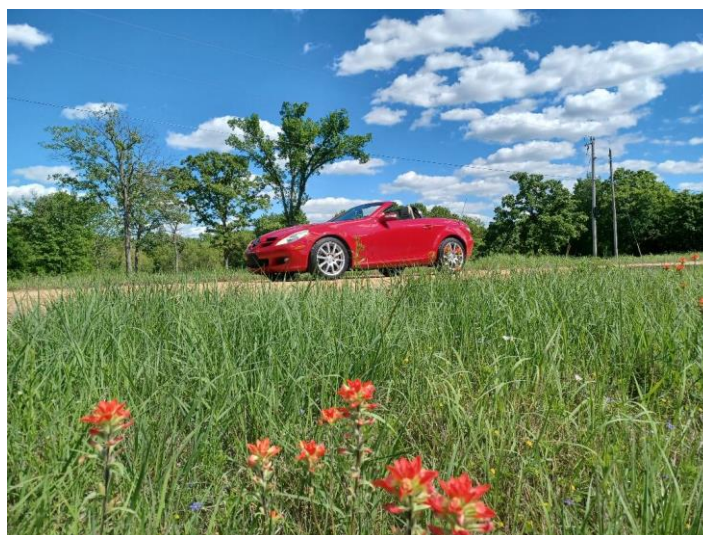
Indian Paintbrush wildflowers on a beautiful spring day