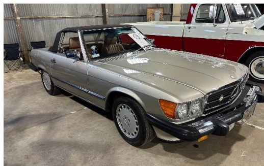
Imports award winner

Questions call chapter President at 918-361-6967 or the National Business office at 1-719-633-6427 M-F 8am – 5pm