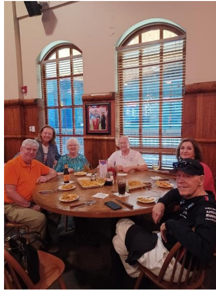
Lunch was only 5 minutes away in Bricktown at Toby's Place