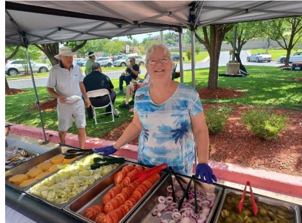
Teamwork and planning always makes for a good event