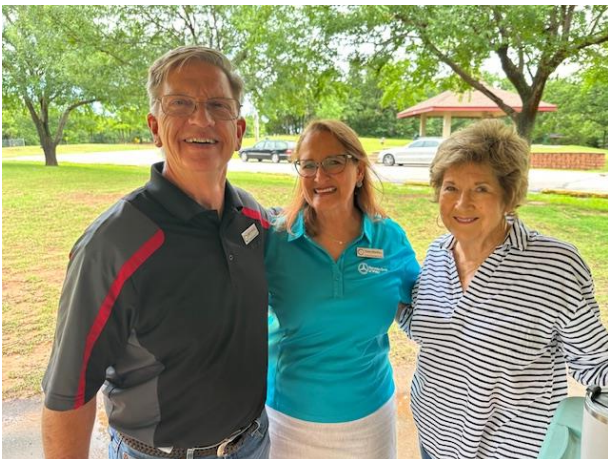
Thanks to the organizing committee for a great job