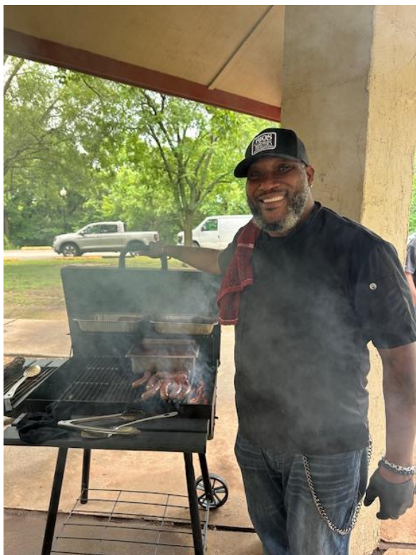
The Food Dude King was back