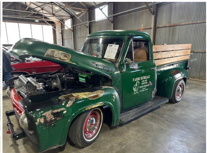
Not your average farm truck