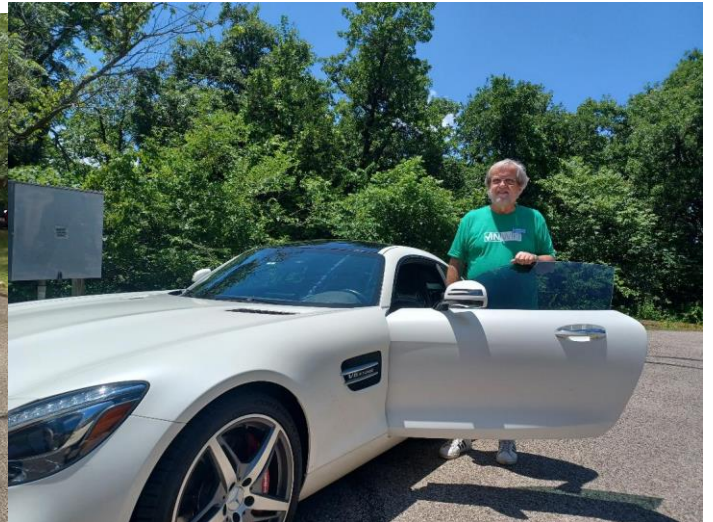
Lots of options from wagons to sedans and some we don't see every day