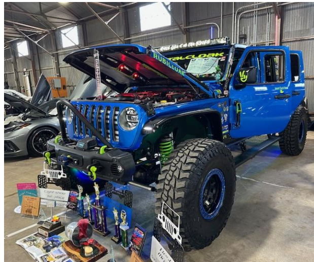
$100,000 worth of modified parts and accessories