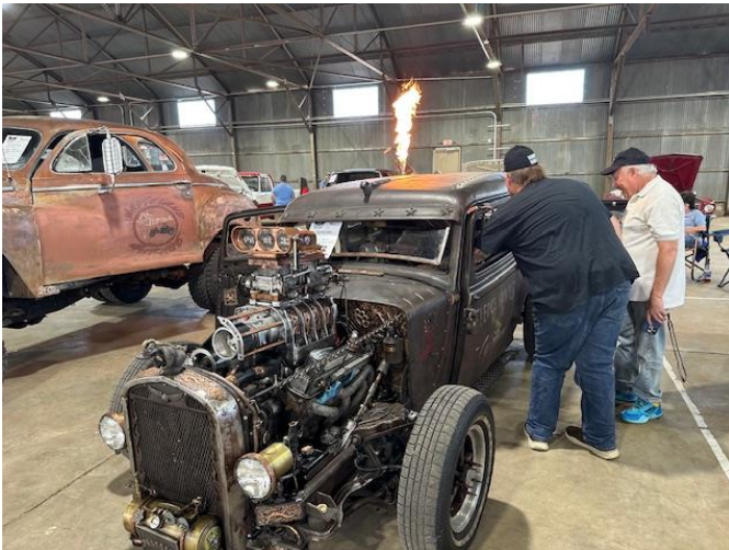
Quite a few rats in the house