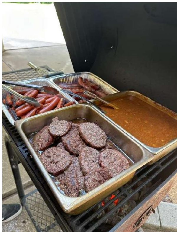
More than enough to eat