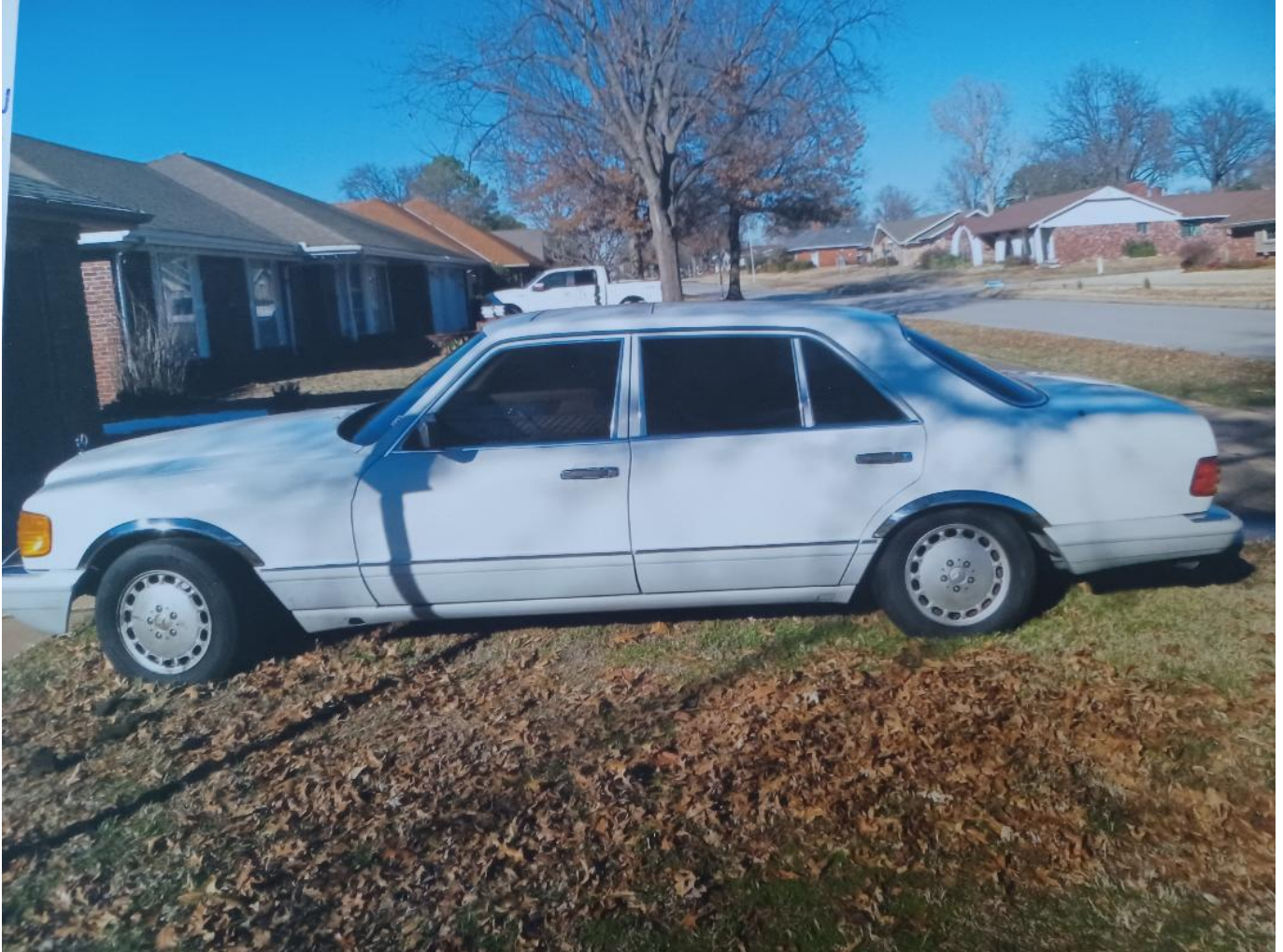
1991 Mercedes Benz 560SEL, 178,000 miles, White/Palomino