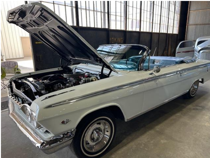
Original Impala beauty