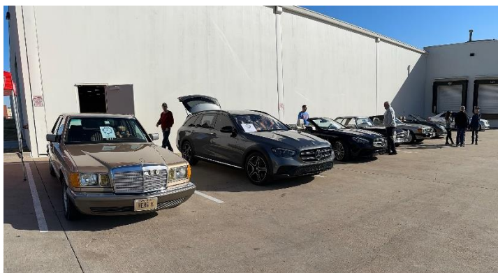
Mercedes Benz showcase at Gateway Classic Cars

Saturday, September 20 Alzheimer Walk for the Cure 8:00am Dream Catchers Park Tulsa OK