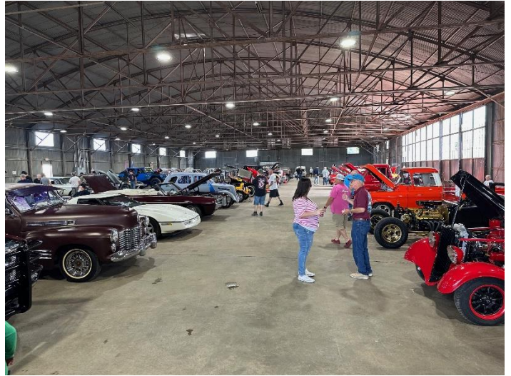
40 different classes of original and modified car judging