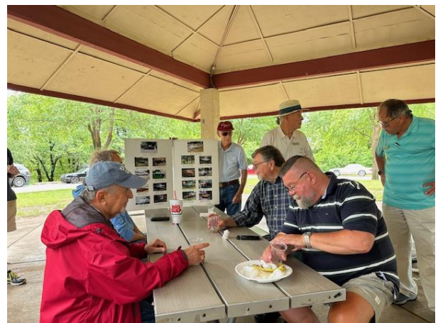
Great food and company