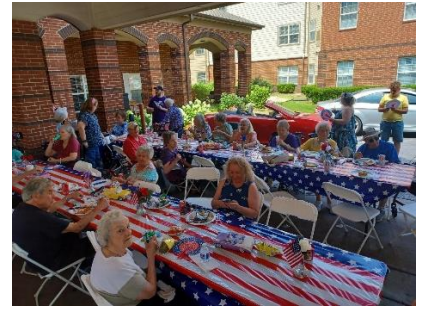
Sunny weather and some great cars for senior residents to admire