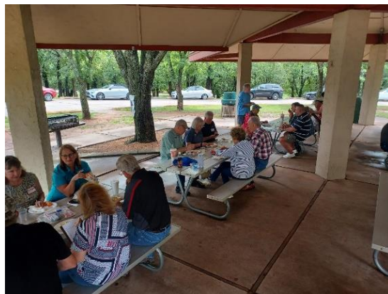
The park was filled with all types of Benz