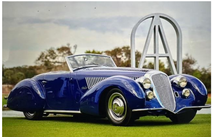
Best of Show: 1938 Alfa Romeo 8c 2900B

Classic Mercedes, Duesenberg's, Stutz, Rolls Royce, Ferrari's, Delage, Aston Martin's, Auburns, Mercer's, Packard's, Porsche, and more.