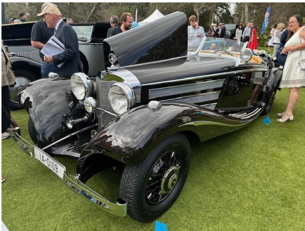
1936 Mercedes Benz 540K

I saw things to dream about. Two class winning Mercedes Benz.