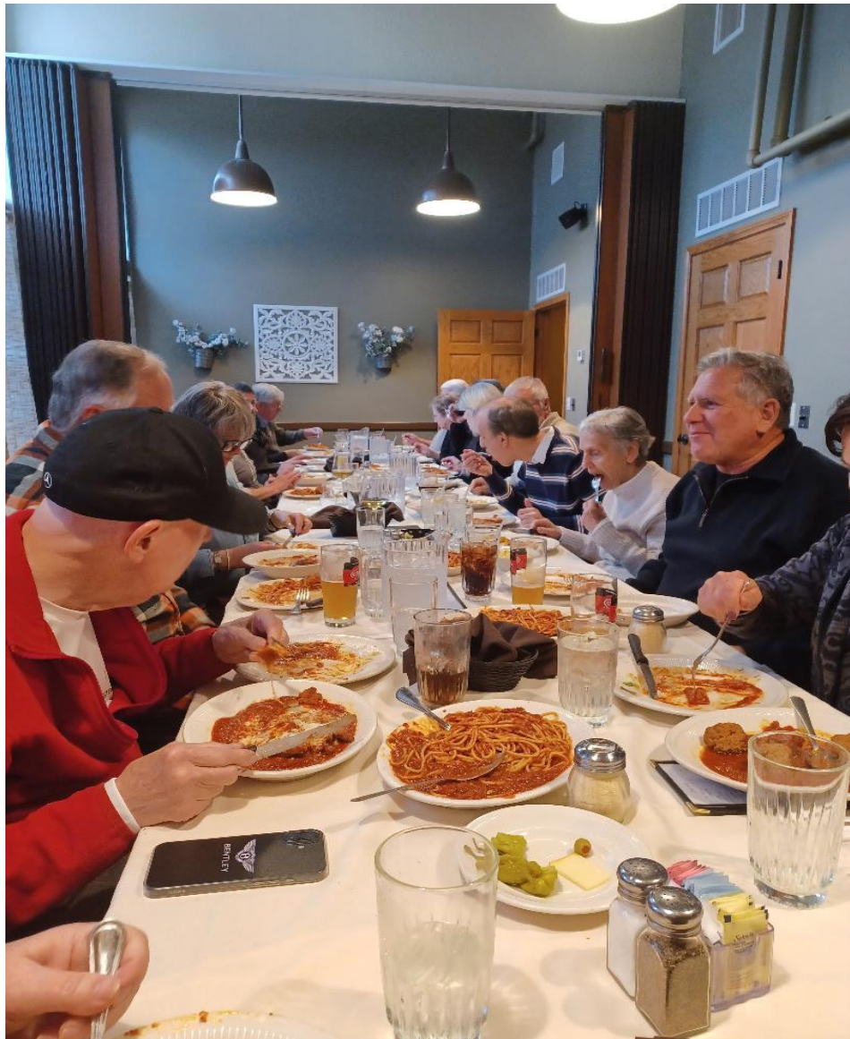
Family Style Spaghetti and Meatballs

The weather may not have been the best with light showers along the drive, but the food more than made up for the less than perfect weather. After lunch, members could take in some local attractions like Lovera's Italian market.