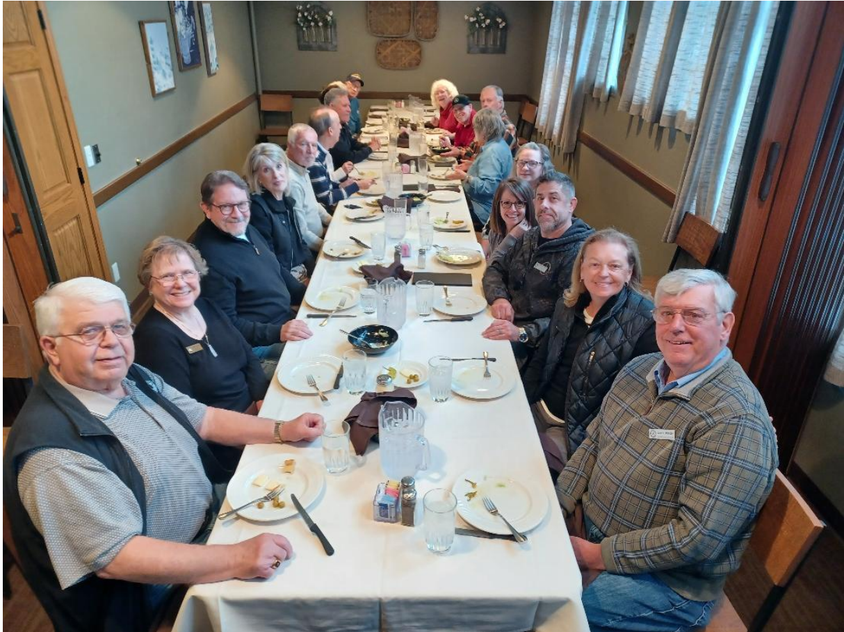
Hungry Diners wait for their Taste of Italy