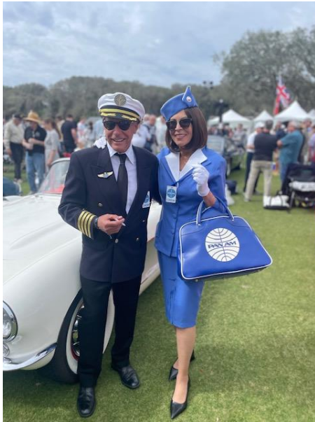
Pan Am crew with their Corvette