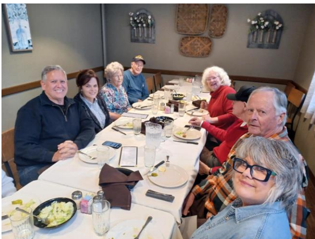
Pasta, Meatballs and Sausage-Oh Boy