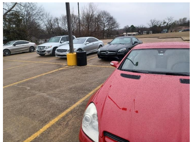
RAIN OR Shine –We Dine