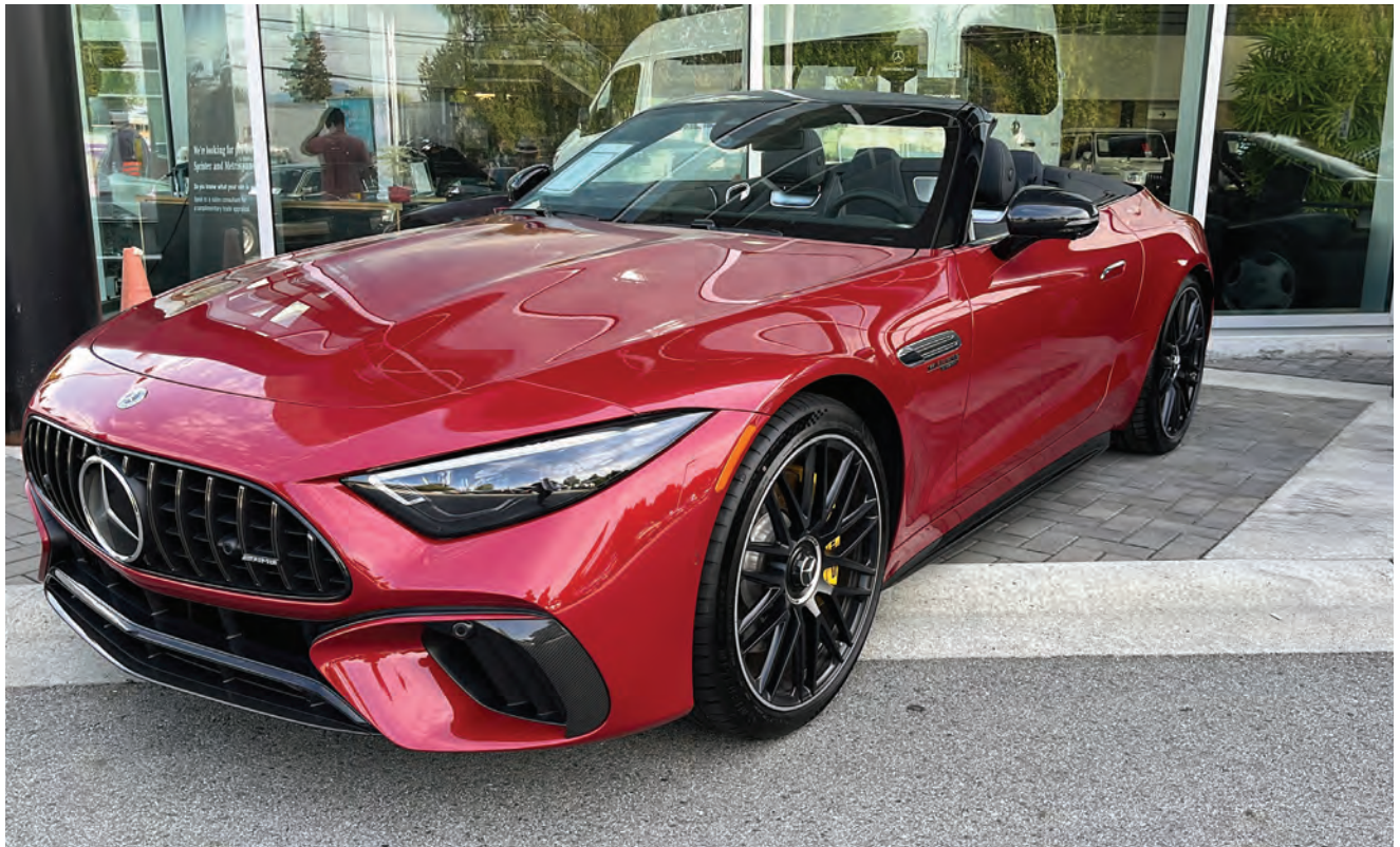
Image taken at 2023 Show & Shine - Dilawri Mercedes-Benz Boundary, Vancouver.