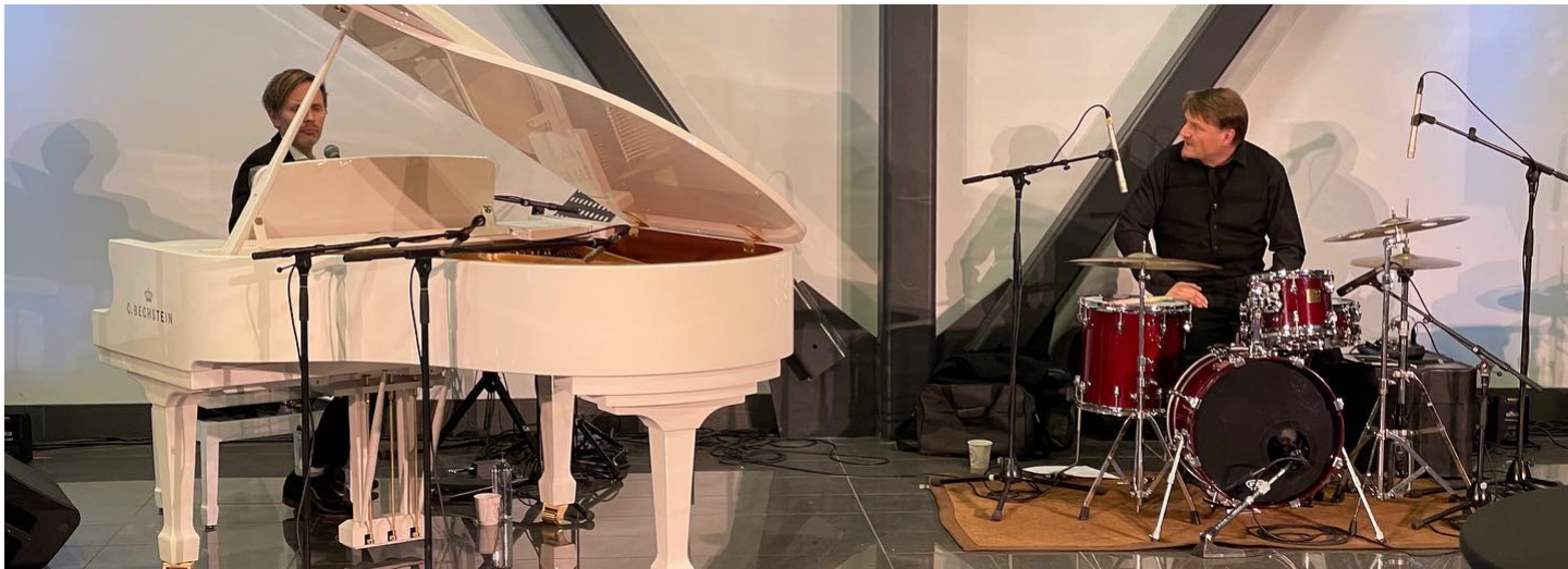
Another image from the May 2022 EQS Launch event.