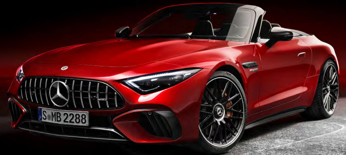
The New 2022 SL 63 AMG

Mercedes-Benz Langley | 20801 Langley Bypass Langley, BC