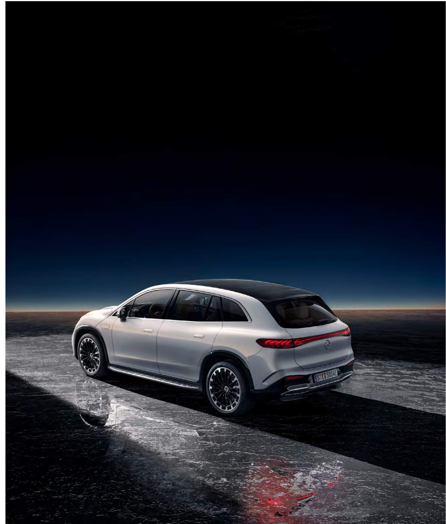
The new Mercedes-Benz EQS SUV.

The trade names & trademarks “Mercedes-Benz” and “Mercedes” and the three-pointed star in a circle are owned by Daimler AG and authorized for use by its licensees - which include MBCA - exclusively.