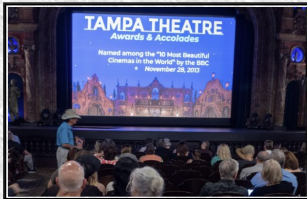
Tampa Theatre August 18, 2024