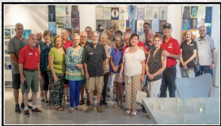
Imagine Museum June 23, 2024